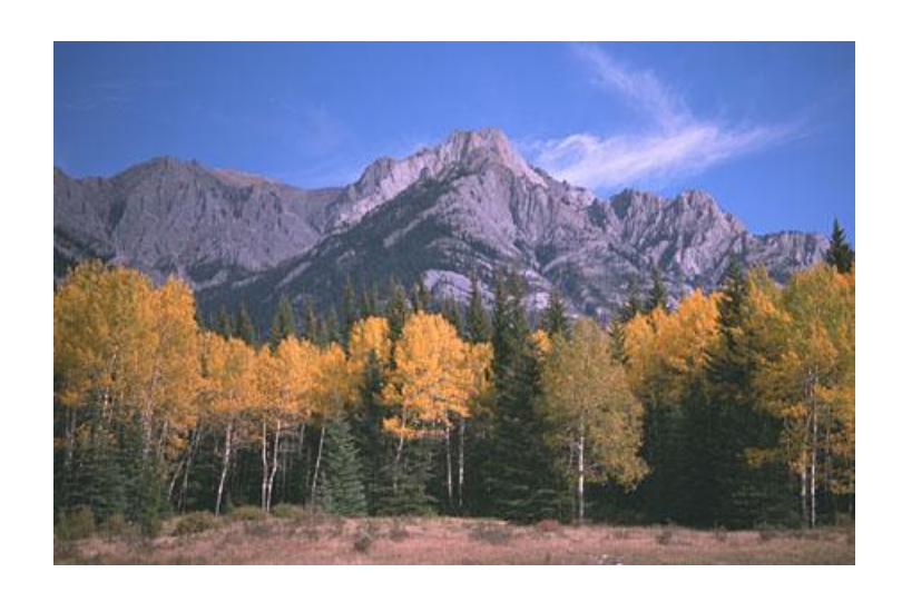
Mountains can have trees.