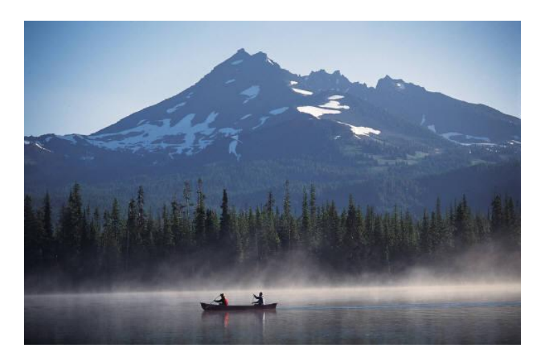
Mountains are big.