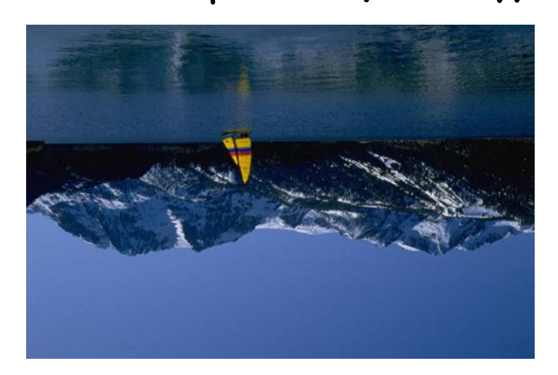
Mountains can have lakes.