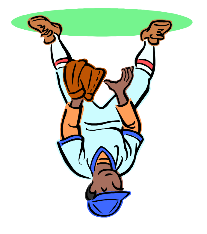
I see Matt. I see his mitt.