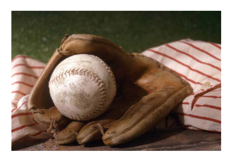
I see the mitt.