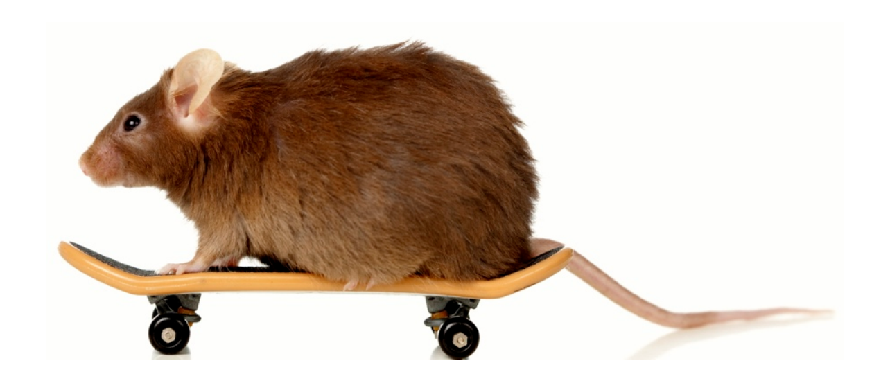
Willy Could Not Sit Still

Willy was a rat that lived a quiet life, but one day he could not sit still.