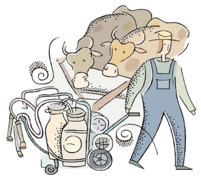
I Have Two Cows