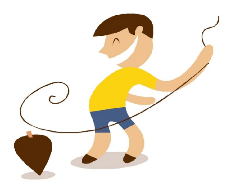
I Have a Little Top