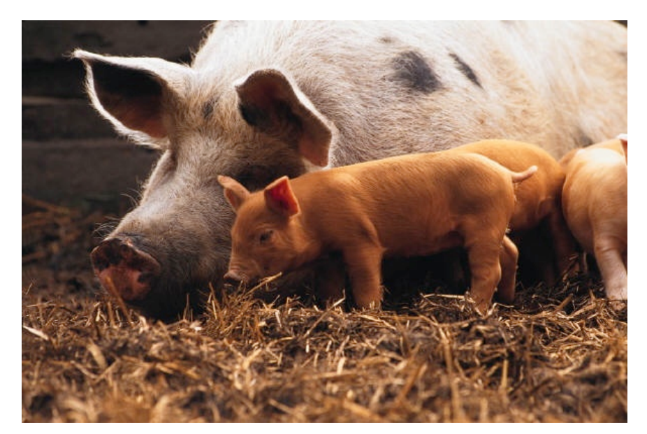
Pigs Live on Farms