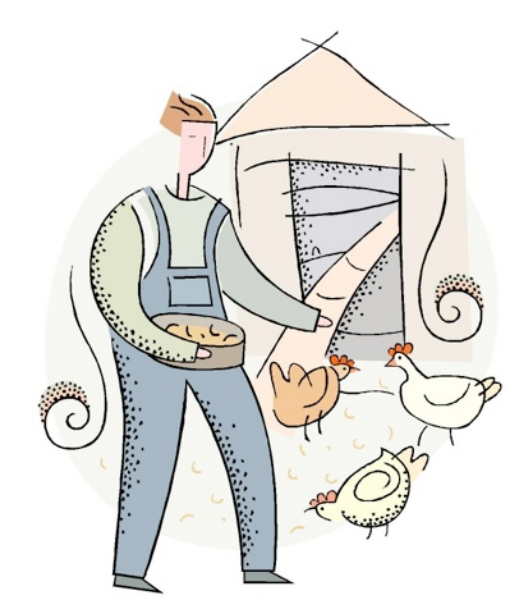
I Have a Small Farm