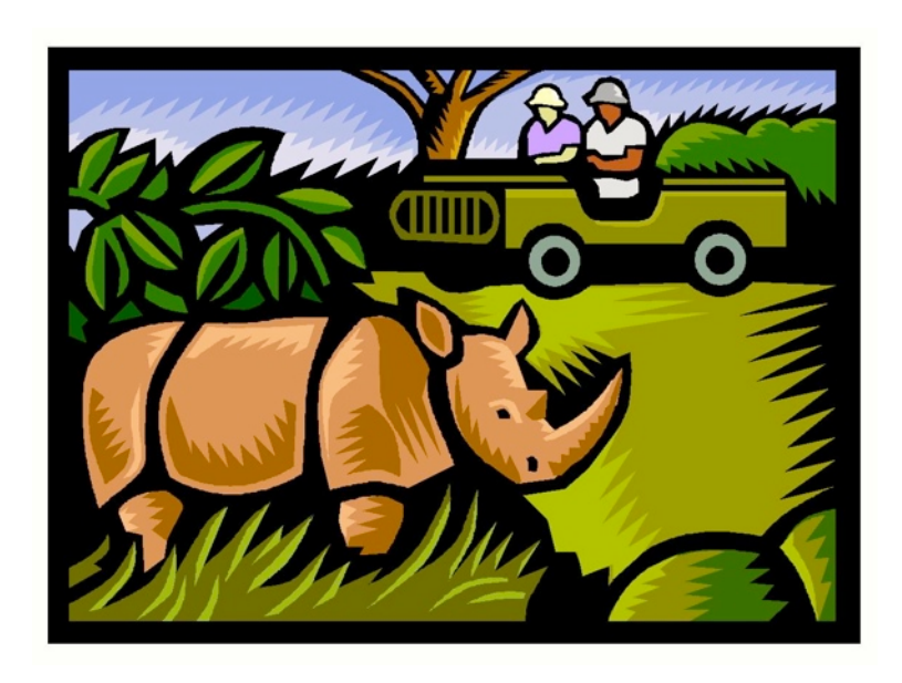
In a Jeep

One day Zack went with Baxter in a jeep.