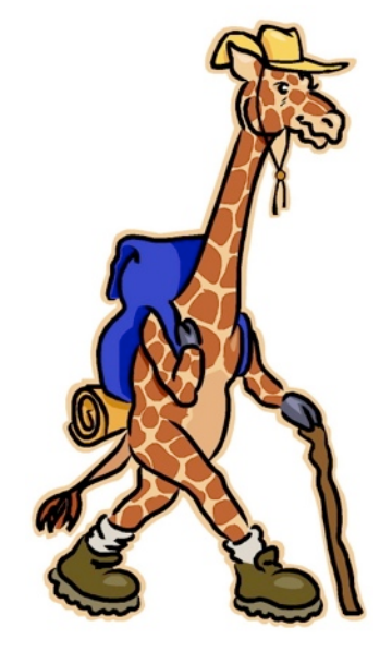
I am Baxter

I am Baxter. I am a giraffe that lives in a zoo. People come and see me at the zoo.