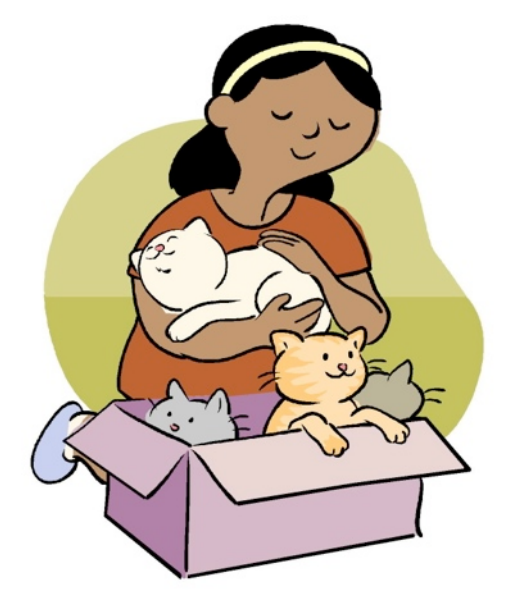
My Kittens Were Born