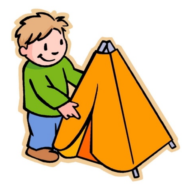
I Have a Tent

I have a tent. It is a neat tent. I want to go camping with it.