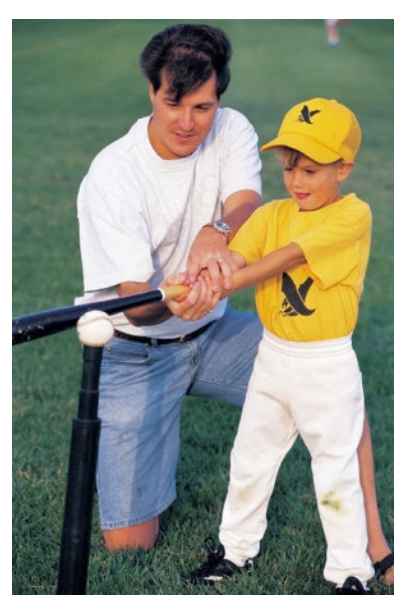
I Want to Play Baseball