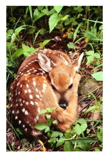
The Little Deer