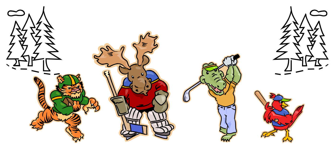
We Went Into a Forest

One morning my dad and I went into a forest. It was a dark forest, but we were not 😩 . Soon we met a 🖺