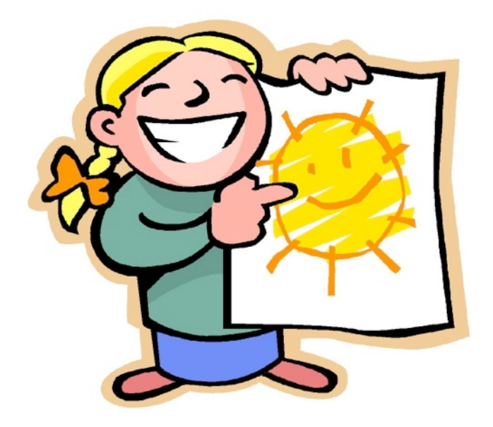
This Is the Sun