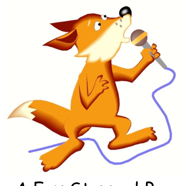
A Fox Stopped By