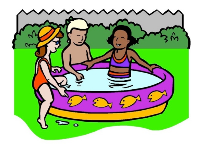
Come On and Get In