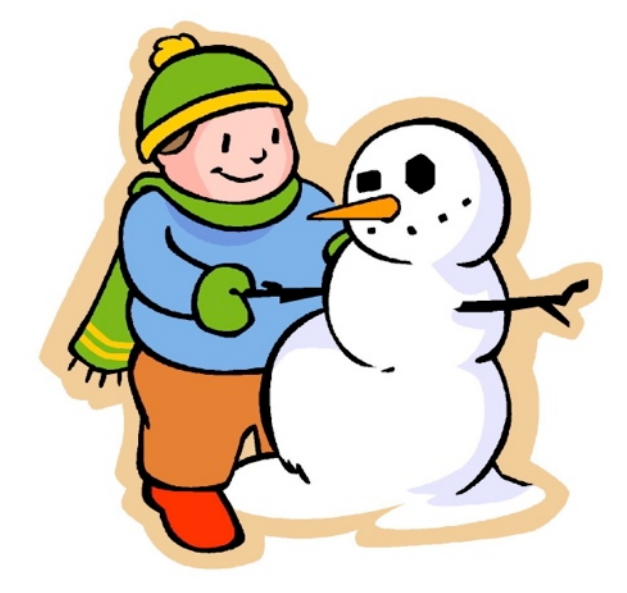
It Got Cold This Week