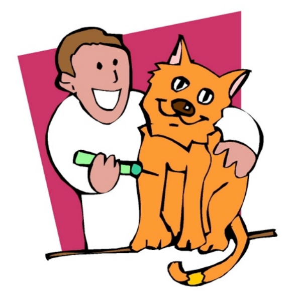
Peg Goes to the Vet