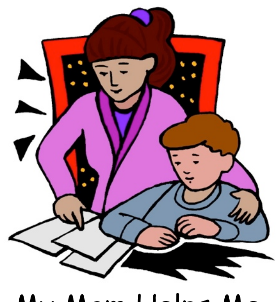
My Mom Helps Me

I work on my work from school at the end of the day.