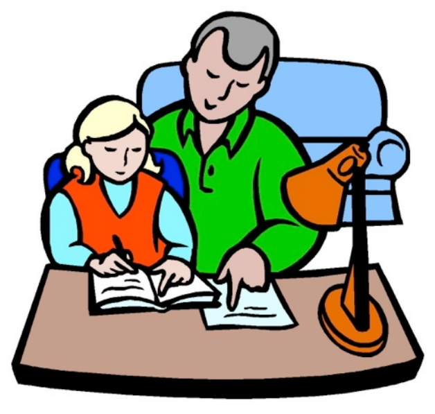
My Dad Helps Me

I work on my work from school at the end of the day.