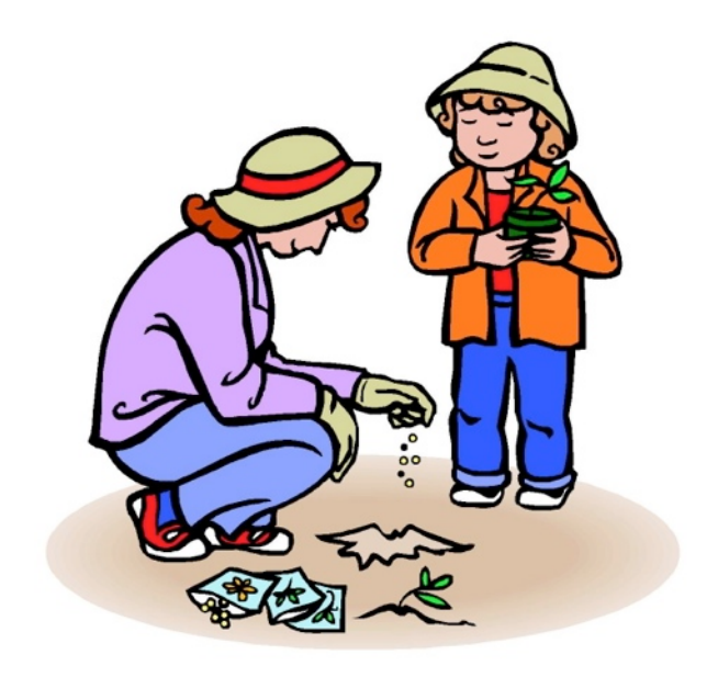
My Mother Has a Garden

My mother has a garden. It is a neat garden.