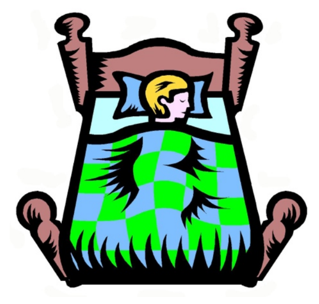
I Sleep Under a Quilt