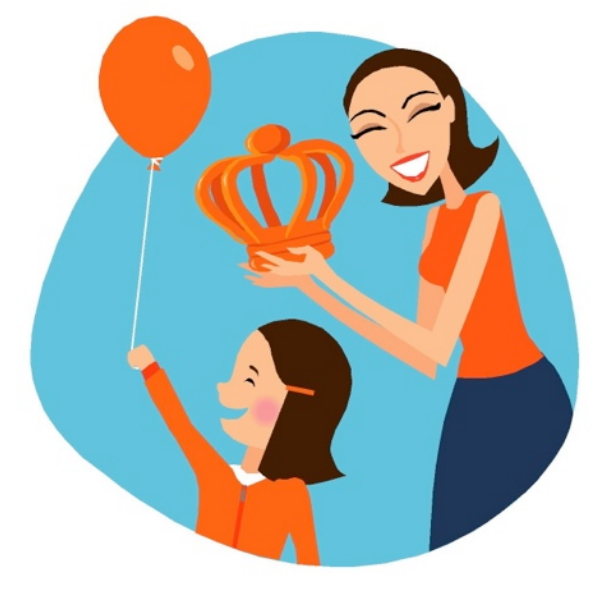
I Want to Be a Queen