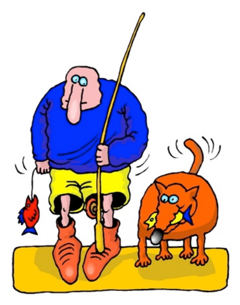
My Dog and I Go Fishing