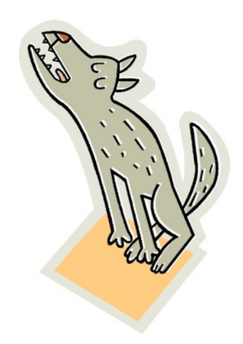
Pip the Dog

Last week Pip the dog sang a song to the moon.