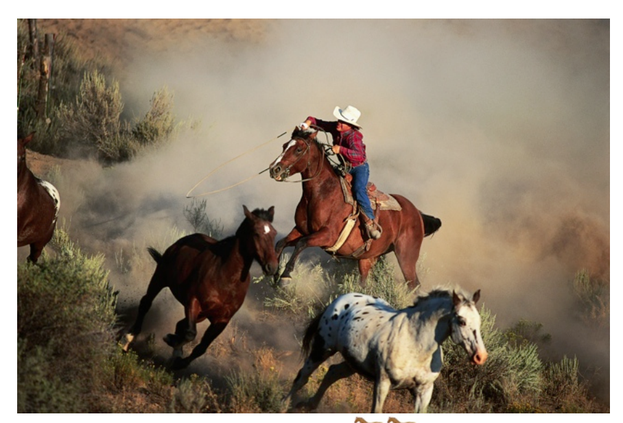
Look at the Horses Run