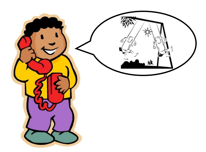
My Friend Called Me

My friend called me. He wanted to tell me about his day.