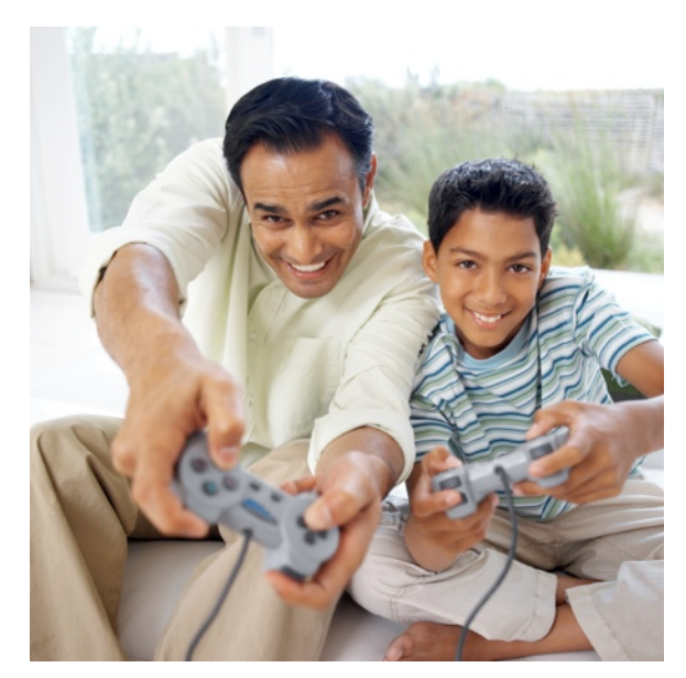
This is My Father