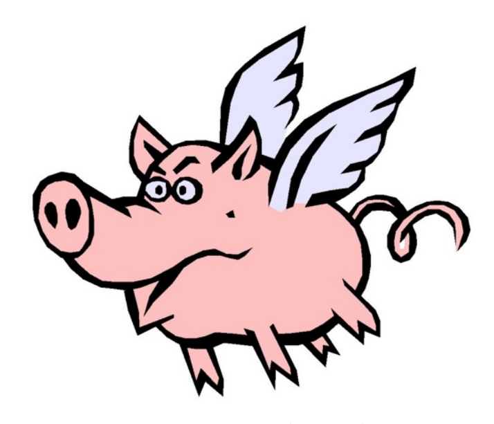
A Pig Could Fly

One day a pig called Yankee was by a stream. He was about to eat a little snack from his picnic pack when a rock that was near by yelled, "You, pig. What do you want to do?"