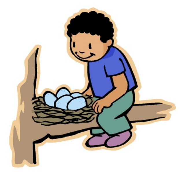
One Day I Went Up a Tree