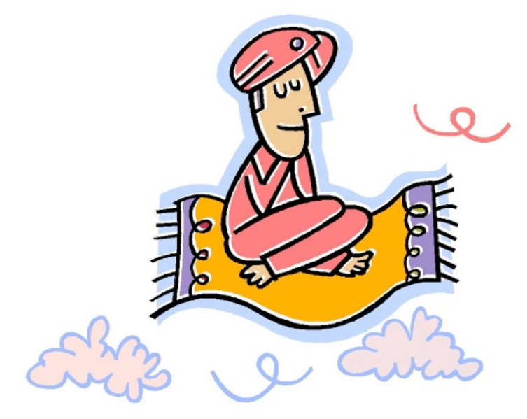
I Met a Man Who Had a Rug

I met a man who had a rug. It was a neat rug.