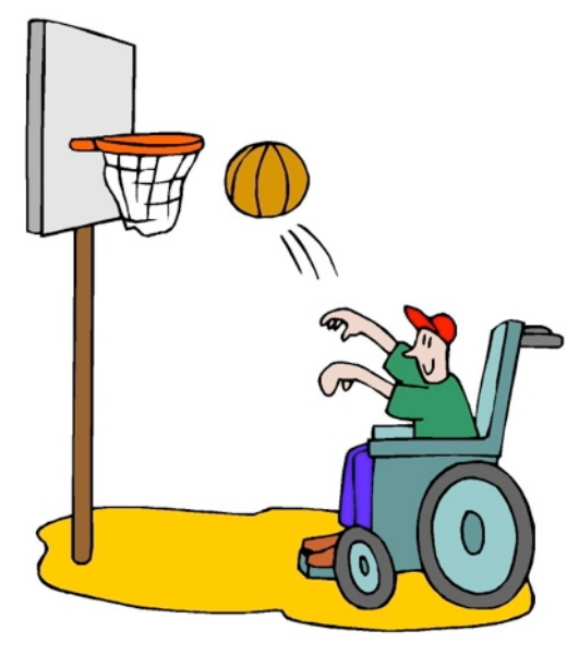
I Had a Basketball