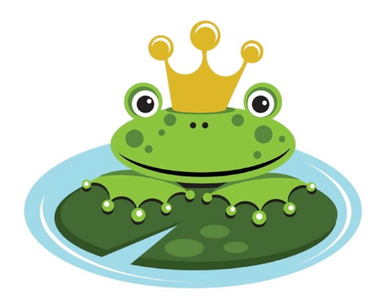
Fred is a Frog