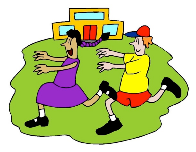
I Want to Run

"I want to run. It will be fun," I said.