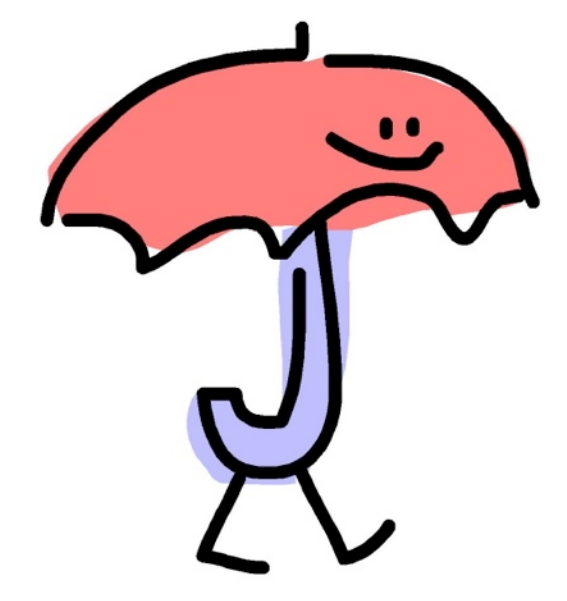
Fred is an Umbrella

"I am Fred, and I am an umbrella," said Fred.