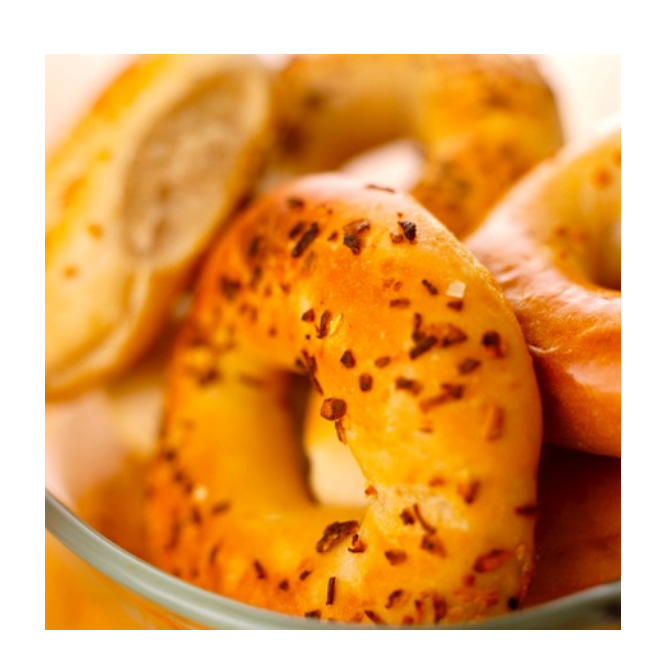
Maybe I should eat a bagel.