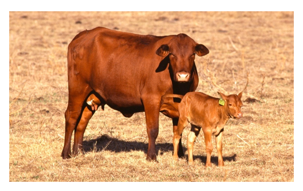
Look Out There and See a Cow

"Look out there and see a cow," said the boy.