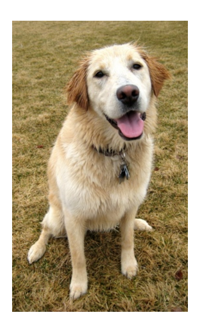
I am a Dog