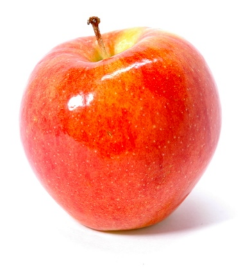
I Have a Red Apple