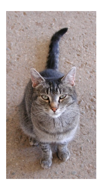
I am a Cat