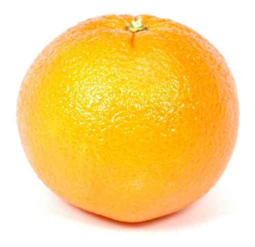
I See My Orange