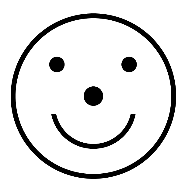
Can You See Me?