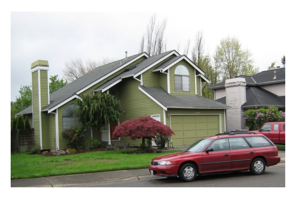
Not My Home