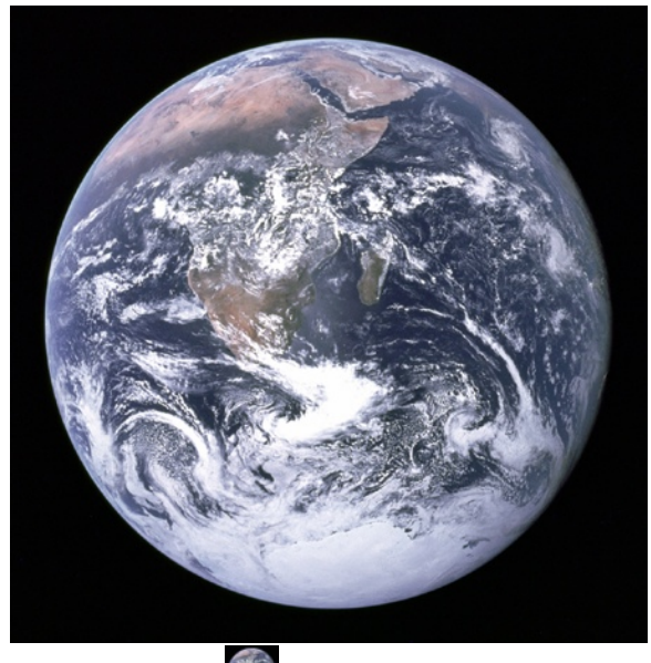
The Earth is Round