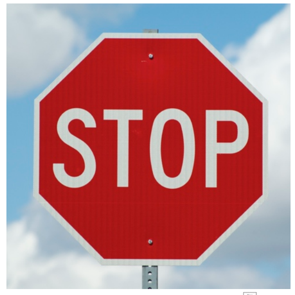
This is a Stop sign