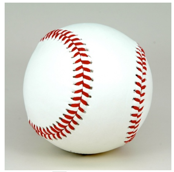
A Baseball is Round