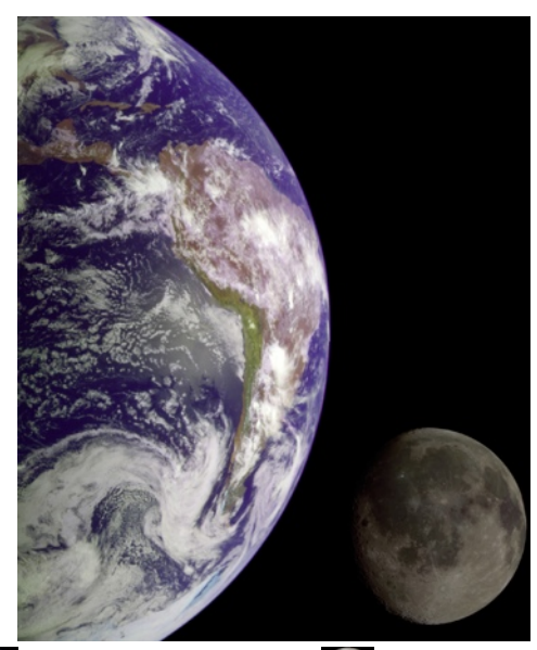
The Earth and the Moon Are Round