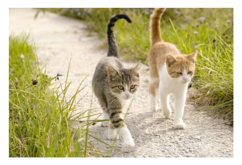
The Two Cats Went For a Walk