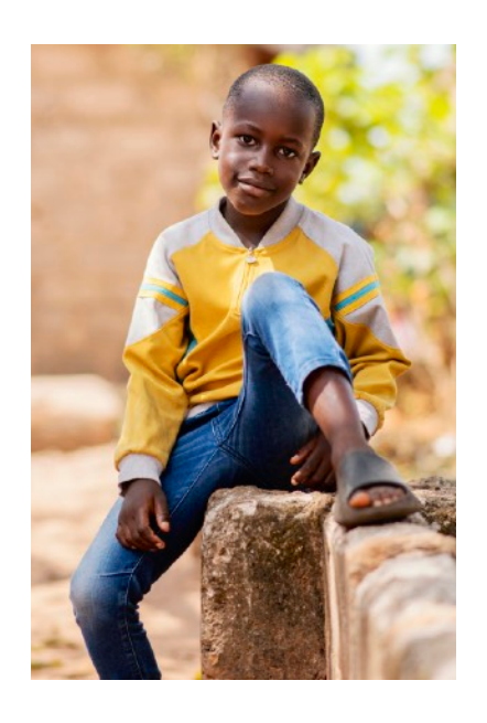
Level 6 Introducing: i /i/