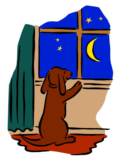
Sid and the Moon