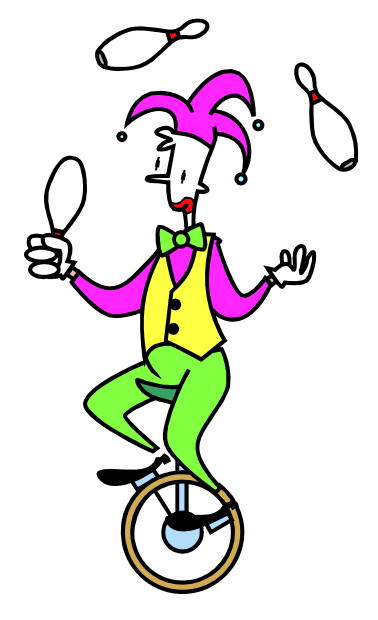
A Neat Trick