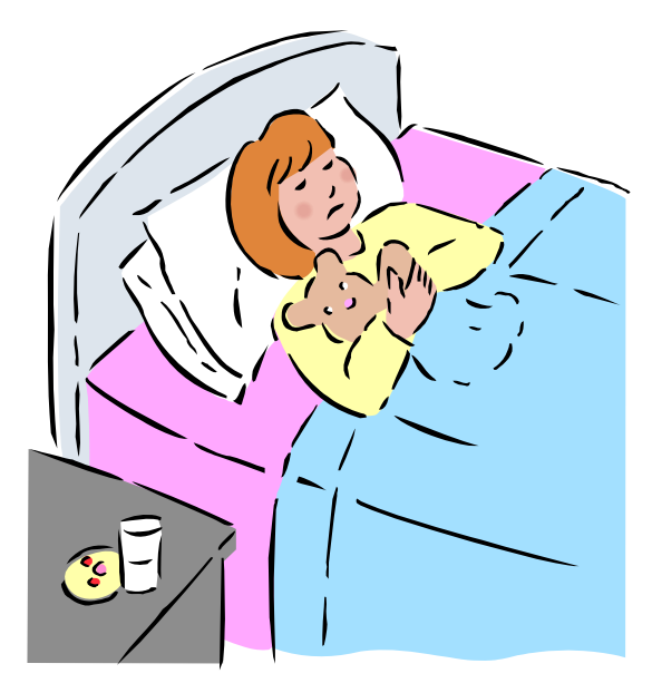
Cass is Sick