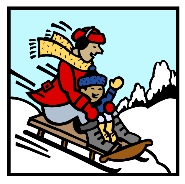
See Me, I'm 1 Dad