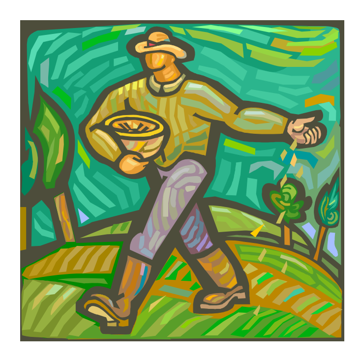
I See Sam Seed