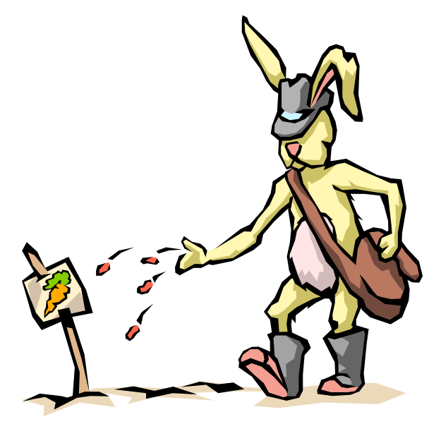
I am Dee