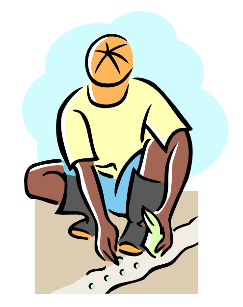
Sam Seeds Seeds