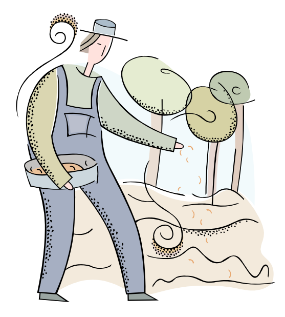
Dee Seeds Seeds