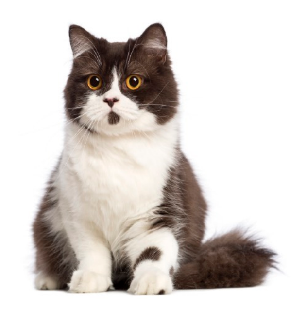
Level 17 Introducing: c/k/